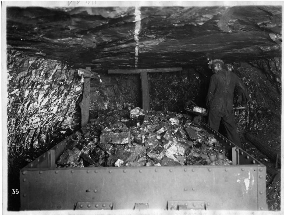
Fig. 4. Miner loading coal in the portal #31 mine in Lynch, KY. Circa. 1920.

evenness, in that you couldn't differentiate between White and Black men when both were smothered in dust and enduring similar conditions. 9 Reminiscing about conversations he would have with his father, Turner notes: "When you go in that hole every day you go in even and you come out, you are dark . . . You couldn't tell from the face of a White man and you can't tell the face of a Black man that's when you are even." The common fear and fate that defined a lifetime of coal mining had an equalizing effect on Black and White relations, to some extent.