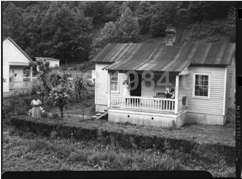
Fig. 3. Photograph of a home abutting the mountainside in Harlan County, KY.

The gardens, livestock, and the mountains provided not only biological, but also cultural vitality. The seasonal slaughtering of hogs brought the community together as each social group had their own role. Each fall, the Black men in the community would